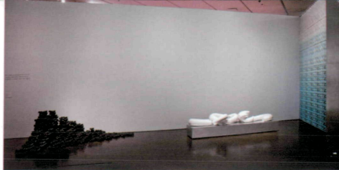
Right: Del Harrow. Wedgewood Black Hive/Hole . 2011. Slipcast black porcelain.